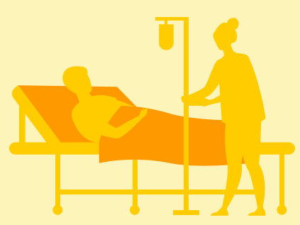
For family doctors and those working in emergency departments...

To recognize GPP as a potentially life-threatening autoinflammatory skin disease needing urgent specialist referral and treatment.9